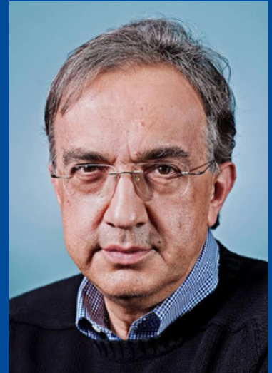
Sergio Marchionne (1952-2018)

Sergio Marchionne's legacy continues to inspire others to bridge the gap between their professional success and their commitment to giving back.